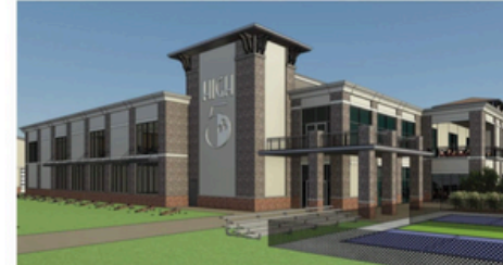
Perspective from Northwest