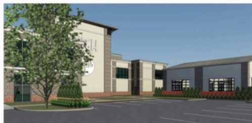
Perspective from South (Approach to Pickleball)