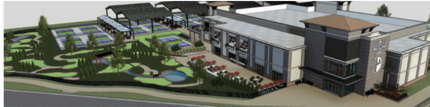
Aerial Perspective from Southwest